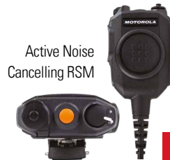
Active Noise Cancelling RSM