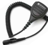
Remote Speaker Microphone