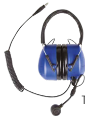
Twin Cup Headsets

SAVOX HC-1 Helmet communications with bone conductive microphone and ear piece